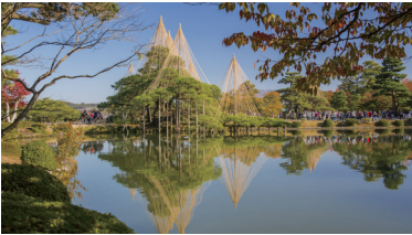
The yukizuri ropes, snow protection for trees in Kenrokuen Garden

The townscape of Kanazawa and its unique culture and art have been formed since the Edo era. In the city, there are many historic gardens, temples and shrines, such as Kenrokuen Garden, one of the three greatest gardens in Japan. Also, Kanazawa is dotted with carefully preserved giant and old trees. Here is a two-hour course to walk in and around Kenrokuen Garden while thinking about the old days.